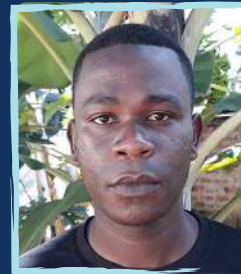
Damas Student Support Worker