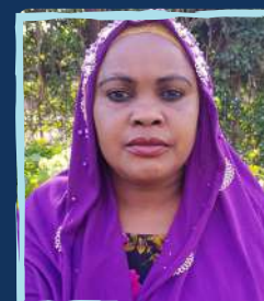
Ummy Student Support Worker