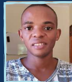
Juma Student Support Worker